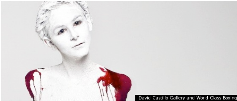
David Castillo Gallery and World Class Boxing