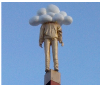
Head in the Clouds (Grand Central), 2011

Perched high above the rooftop of Grand Central, a person in a hoodie has his or her head stuck in a fluffy cloud. The piece was created for the Grosch-sponsored Get the Green Light series. Head in the Clouds is one of 10 public art works commissioned by the green beer in the hopes of highlighting Miami artists during a week when local talent is too often ignored.